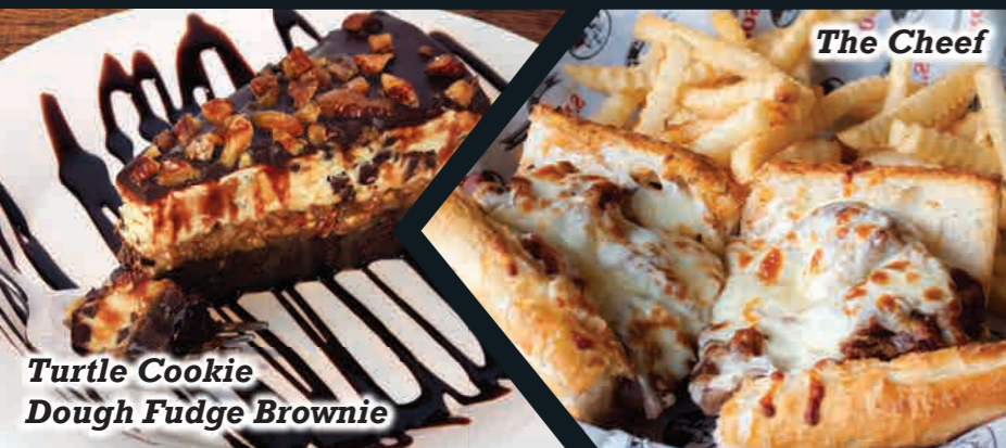
Turtle Cookie Dough Fudge Brownie