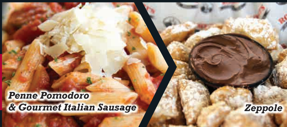
Penne Pomodoro & Gourmet Italian Sausage