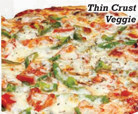
Thin Crust Veggie